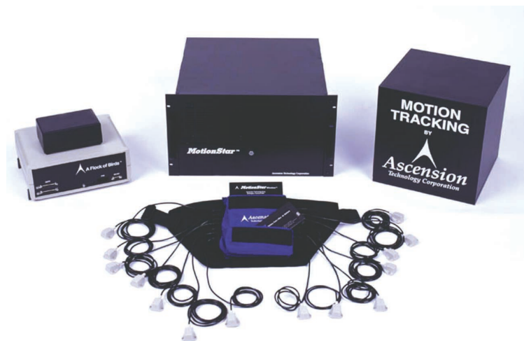
Figure 2. MotionStar DC magnetic tracker, a precision system used in motion capture for computer animation, tracks the position and orientation of up to 108 sensor points on an object or scene. Key components include (left and right) the magnetic pulse transmitting antennas and (center) the receiving antennas and controller.

Several groups have explored using computer vision technology to figure out where things are. Microsoft Research's Easy Living provides one example of this approach. Easy Living uses the Digiclops real-time 3D cameras shown in Figure 3 to provide stereo-vision positioning capability in a home environment. 11 Although Easy Living uses high-performance cameras,