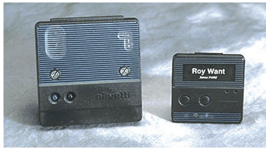
Figure 1. Olivetti Active Badge (right) and a base station (left) used in the system's infrastructure.

A general technique for providing recognition capability assigns names or globally unique IDs (GUID) to objects the system locates. Once a tag, badge, or label on the object reveals its GUID, the infrastructure can access an external database to look up the name, type, or other semantic information about the object. It can also combine the GUID with other contextual information so it can interpret the same object differently under varying circumstances. For example, a person can retrieve the descriptions of objects in a museum in a specified language. The infrastructure can also reverse the GUID model to emit IDs such as URLs that mobile objects can recognize and use. 2